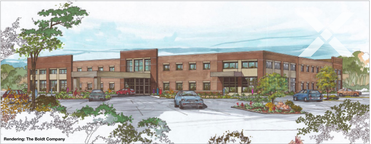
Rendering: The Boldt Company