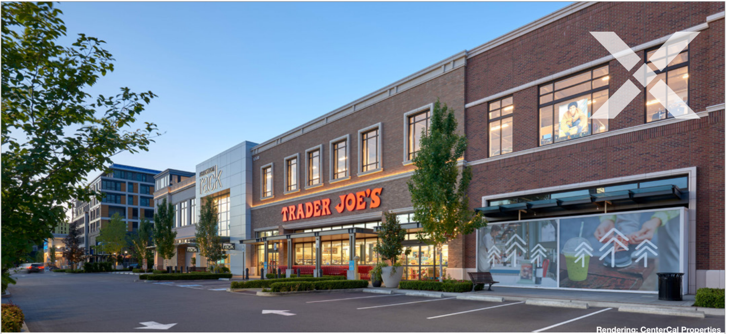
Rendering: CenterCal Properties